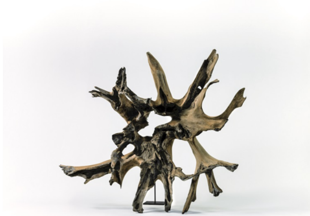
The works on display take their cues from the interconnected webs of the human lung.

Home > Countries > East & Southeast Asia > Indonesia > Como Hotels Sets Sculptures in Bali